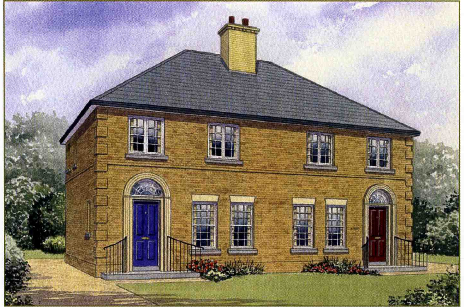
This is an Artists impression and as such, the elevation shown may vary from the actual finish on site.

On the first floor there are 3 superb bedrooms and a bathroom. The layout also provides french doors as standard, oil fired central heating and built in wardrobe spaces.